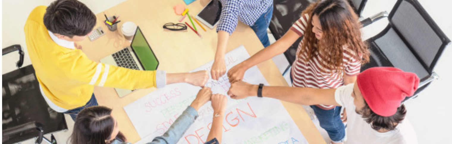
6 Intellectual Outputs Were Produced Within The Scope of The Project.

This project was studied on the inclusive education and the development of an entrepreneurial ecosystem.